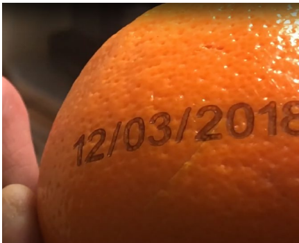
Fruits & vegetables marking