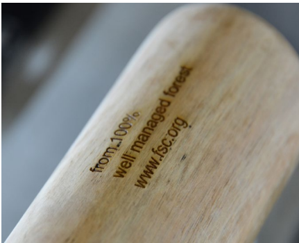
Marking on wood