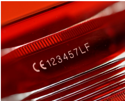
Glass & transparent plastics