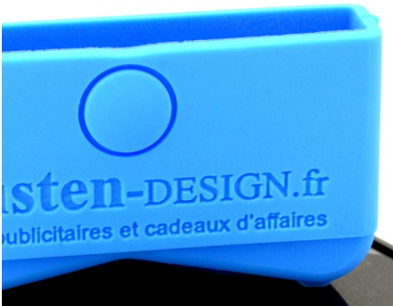
Non-contrasted marking on plastics