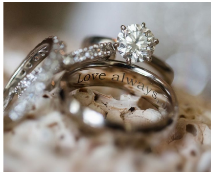
Personalizing and engraving jewelry