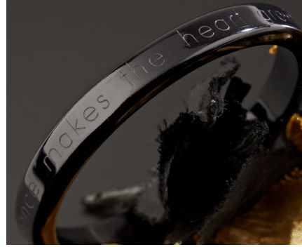
Personalizing and engraving jewelry