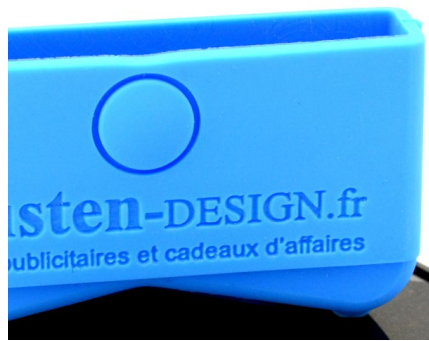
Non-contrasted marking on plastics