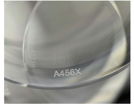
Marking on labels