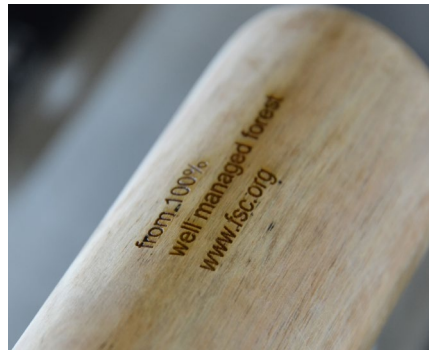
Marking on wood