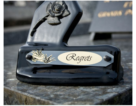
Funeral plaques and headstones engraving