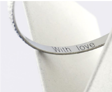
Personalizing and engraving jewelry