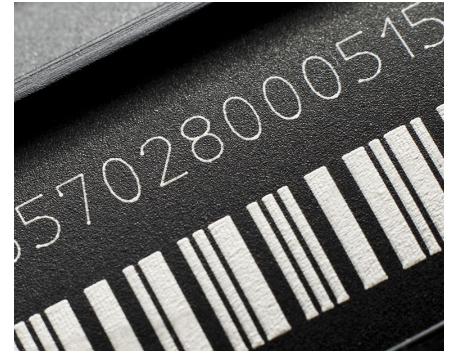
Marking on labels