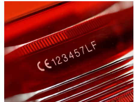
Glass & transparent plastics