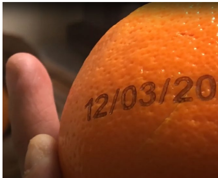
Fruits & vegetables marking